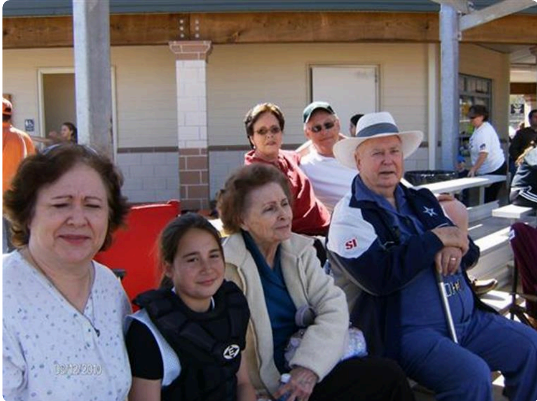
Fun times at the ball park